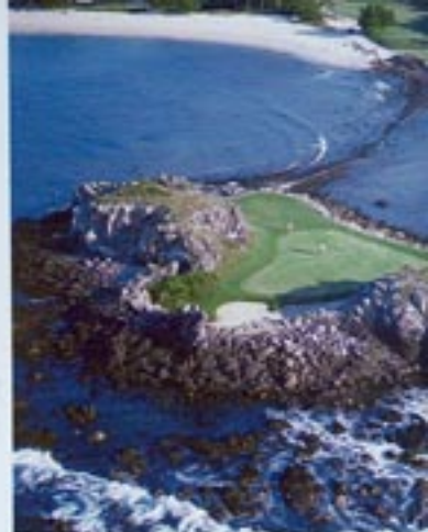
Other Punta Mita residences.