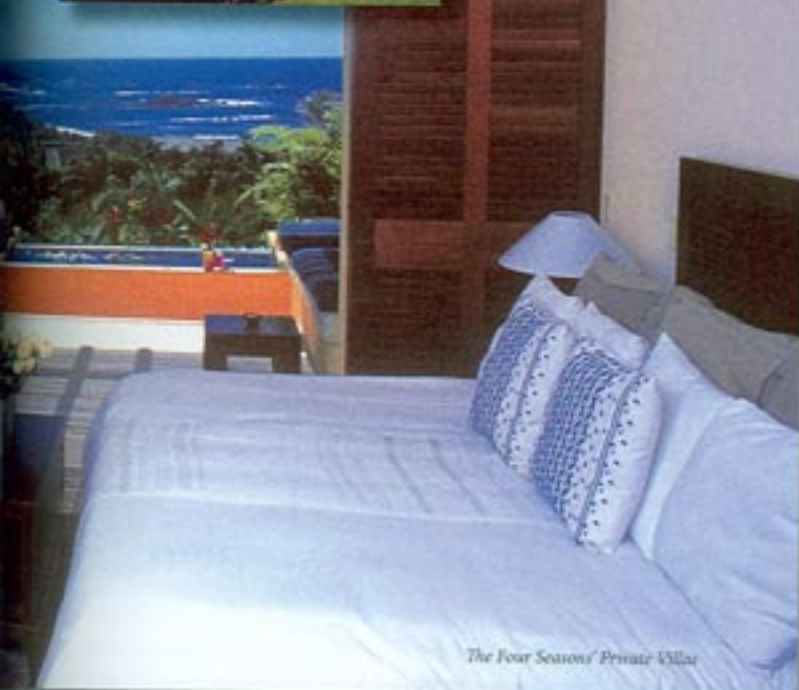
The Four Seasons' Private Villas

These very luxurious villas sit overlooking the Four Seasons Resort and the ocean below. They are very secluded and when swimming in your own infinity pool its easy to forget this is actually a resort and not simply your private residence. But of course all the resort amenities are very tempting.