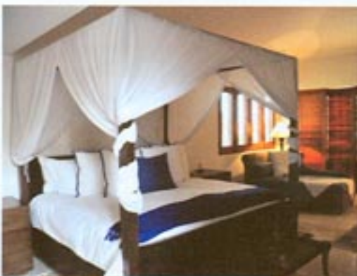
A personal chef completes the luxurious appointments at Las Palmas de Punta Mita.