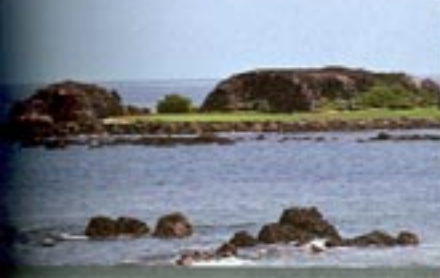
Enjoy Punta Mita's signature Jack Nicklaus Golf Course.